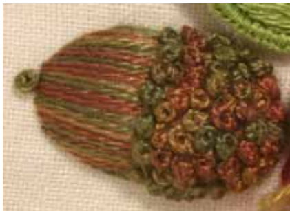
Using a space dyed thread french knots over stain stitch for the bottom of an acorn