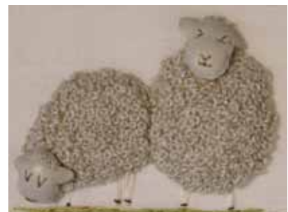
Used over layered felt for sheep bodies