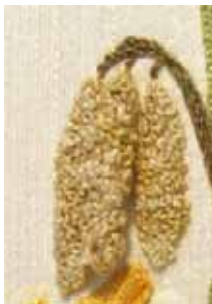
Used over strands of thread that have been bound and French knots applied over the top for this catkin