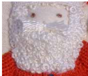
Over layered felt to make Santa's beard