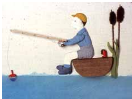
Project No 3 The Boy Fishing

There are three projects with detailed instruction on how each was made from the initial drawing to the finished design.