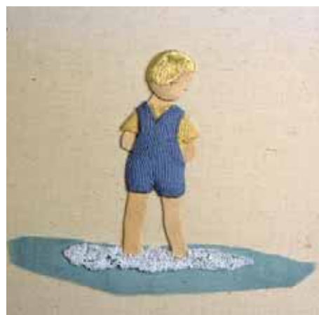
Project No 1 A Boy Paddling

Figures have been an important feature of stumpwork for hundreds of years, and in this book we explain in detail how to make all of the components of a figure - limbs, head, face, hair, body shape and clothes - as well as providing clear, step-by-step instructions for all of the needlelace and embroidery techniques you need to make clothing and to add details and embellishments to your designs.