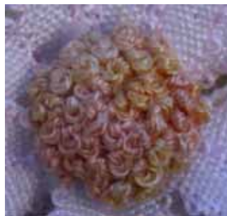
Used over felt stuffed with toy filling form the seed pod of a flower