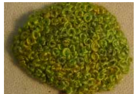
Using space dyed thread it is a useful stitch for making bushes