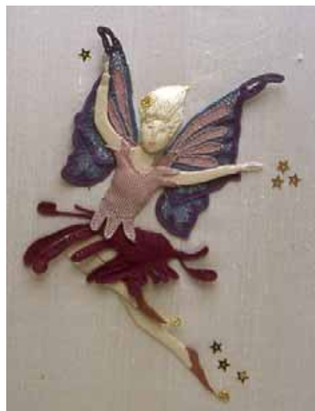
Project No 2 - The Fairy