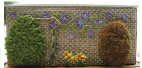
Outside side wall