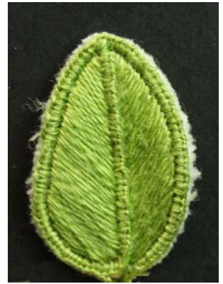
The old way showing quite clearly the frayed calico edges around the outside

When making free standing embroidered leaves we used to say couch a wire around the shape, fill with satin stitch and then cut as close to the edge of the stitches as possible. No matter how neat you were, there were always stray threads showing around the outside of the leaf. If you don't mind using glue, a better way to make the leaves is to embroider the leaves as you did before but instead of cutting close to the edge of the leaf try the following technique.