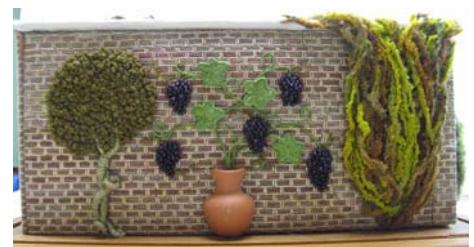
Outside back wall

For the last six months or more Kay has been working a three dimensional walled garden using stumpwork techniques. The inspiration came from seeing Owen Davis's walled gardens at the knitting and stitching show last September. We will give more information in our next newsletter but for now we can show you some photo's of the garden now that it is finished.