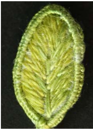
The new way showing a much cleaner edge - This leaf was made in a hurry to show the technique.

When making free standing embroidered leaves we used to say couch a wire around the shape, fill with satin stitch and then cut as close to the edge of the stitches as possible. No matter how neat you were, there were always stray threads showing around the outside of the leaf. If you don't mind using glue, a better way to make the leaves is to embroider the leaves as you did before but instead of cutting close to the edge of the leaf try the following technique.