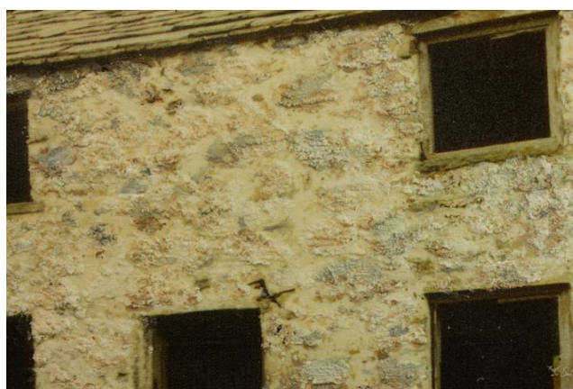
Using expndaprint to add interest to the brickwork