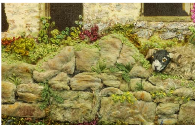
The dry stone wall made with silk rods

This project started with a lesson that Mike gave to Kay's Uxbridge students in using photographs ironed onto a material to be used as the background to a piece of stumpwork. Marjorie wanted to use this old house as her background but the house walls were a bit flat and did not look very realistic. By using some Xpandaprint over the brickwork it lifted the whole of the house wall away from the background material. It seems that the use of this material over the ironed on transfer gave a different effect than when used on plain fabric.