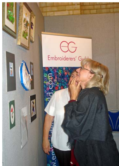
The Duchess of Gloucester looking at the exhibition of students work