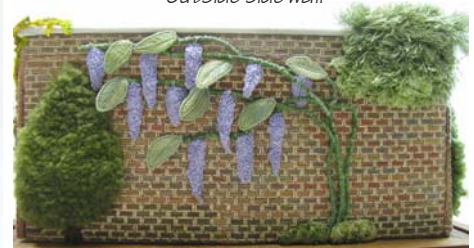
Outside side wall