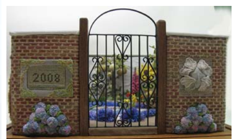
Outside front wall