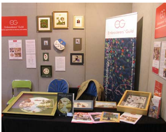
The exhibition of students work at Knitting and Stitching Exhibition

Embroiderers' Guild to put on a display of students work who were taking their City & Guilds course in Stumpwork with the Guild. We were also asked to have our books available and sign them if required. The Duchess was very interested in the students work and delighted with the copy of our book.