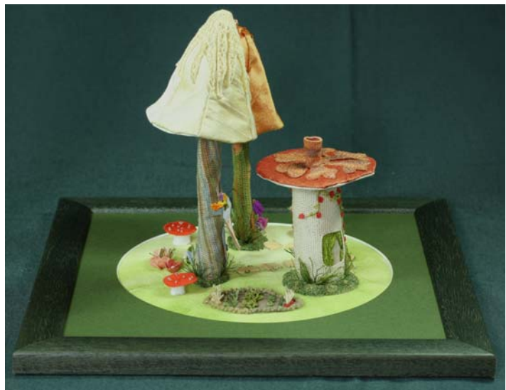
A 3D fantasy garden with free standing mushrooms

In the last newsletter we showed a couple of photographs of a 3D garden. Kay has been developing the techniques for making this form of Stumpwork over the last few months.